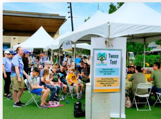
Books and Bees Festival on the lawn