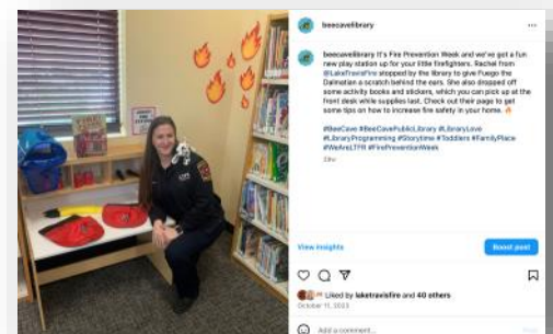
Lake Travis Fire Rescue visited our Family Place play area during National Fire Prevention Week.