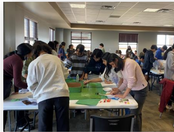
More than 40 teens from area high schools regularly attend TAB meetings to work on service projects and help at library events.

Included programs for all ages such as the Birds of a Feather Show, Family Fort Building, Bubble Party, Reptile Show, and Star Party, as well as age-specific programs such as Special Storytimes, Drive-In Movie, Diary of a Bee Cave Kid, and more