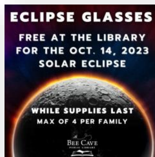
Social media is an effective and inexpensive tool to make announcements about library programs and services.

Social media is also a practical way to announce updates and community partnerships and to remind patrons of our other services, like digital newspaper access. We've been able to share updates with the public about the new library's progress, such as the discovery tours and the design workshop. With over 3,300 followers on Facebook, 2,000 on Instagram, and 2,100 on TikTok, we have a strong library social media base.