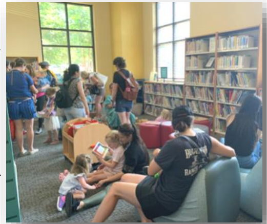
The Family Place play area in the library is very popular.