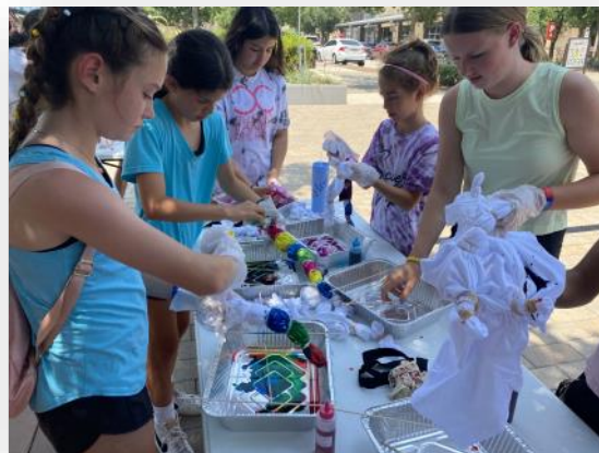
Teen tie-dye program on the plaza