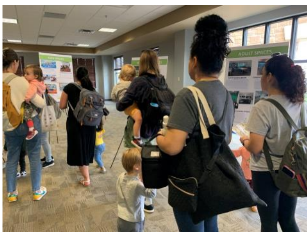
Library patrons gave input on the vision boards after Storytime.

With the selection of the Revival property as our building site, and the approval of Lake Flato Architects, 720 Design, Turner & Townsend, and Hoar Construction, the process of designing the new library began in earnest. Working closely with the library staff, our consultants opened the community input phase by conducting an online survey that received 425 responses. Library staff visited multiple libraries in North and Central Texas along with the architecture and design team to see trends in library design and understand the impact of a multi-story library on operations and staffing. Vision boards were created with photographs from selected libraries of potential features of the new library for the public to consider. These boards were presented for public input on multiple occasions including the Books and Bees Festival, a City Council meeting, after Storytimes, during a Friends of the Library meeting, at a Teen Advisory Board (TAB) meeting, and during in-person focus groups. Community members were given $500 in “Bee Cave Bucks” and allowed to “vote” on their favorite features by showing which feature they would spend money on. A total of 450 families and individuals gave input using the Vision Boards.