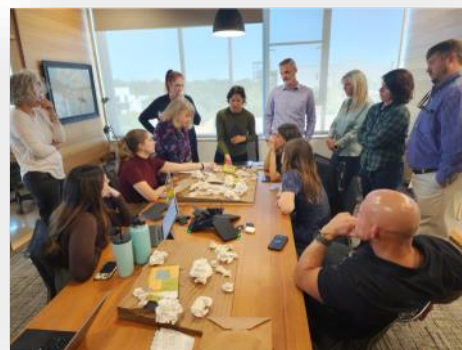
City and library staff meet with design team