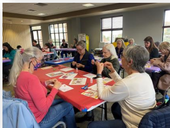
Crafts at What's New Wednesday