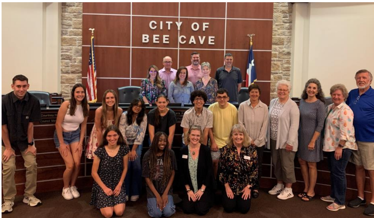
The Friends presented $7,000 in scholarships to ten graduating seniors who had donated their time and talents to the library.