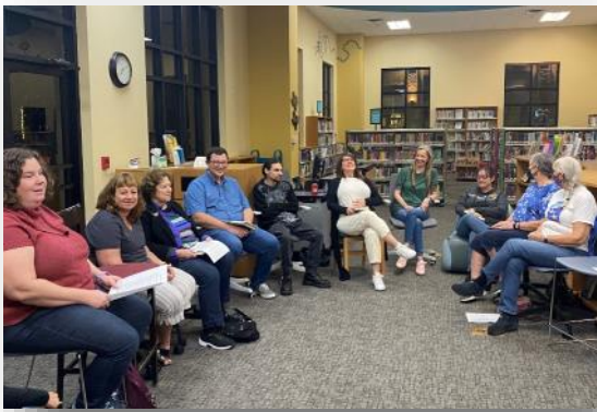
Bee Cave Book Club has added many new members and meets in the library after hours.

Book Club, monthly What's New Wednesday, monthly Lake Travis Reads, annually