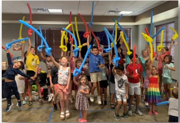
Above Bubble Party on the lawn at left, and Twisty Art balloon “swords.” at right. Below , library staff and kids’ posters hanging in the library.