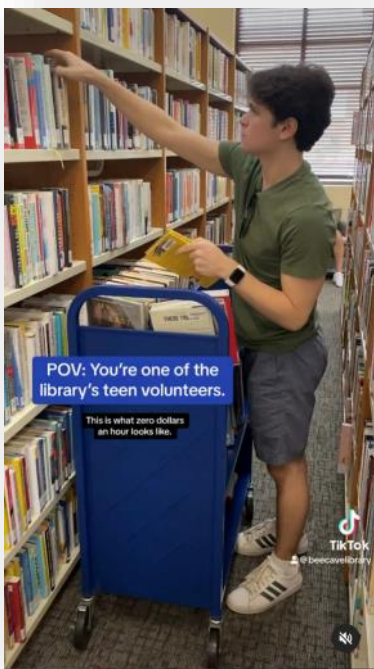
A video featuring one of our teen shelvees saying, "This is what zero dollars an hour looks like," had thousands of views on both TikTok and Instagram and highlighted the work done by our dedicated volunteers.

Social media continues to be an effective and enjoyable way to connect with our patrons. We hear that people find out about events by following us on Instagram or Facebook and also check those sites first to find out about library updates. It's fun for our staff to get involved and patrons will also tell us that they feel like they know us from our social media presence.